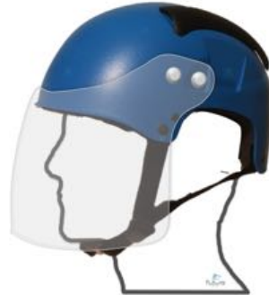
Full Marine visor