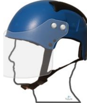
Half Marine visor