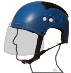
Full semi Smoke