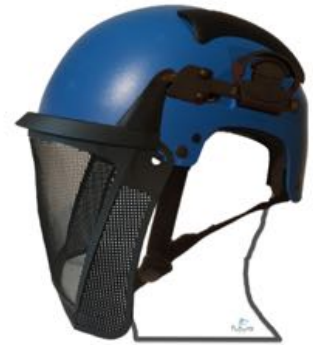
Forestry Mesh visor