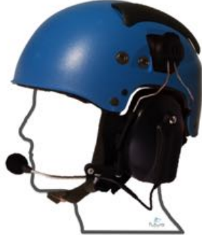
Various options possible