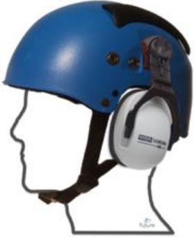
MSA or 3M Peltor available