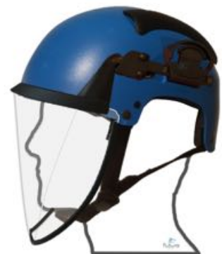
Clear Polycarbonate visor